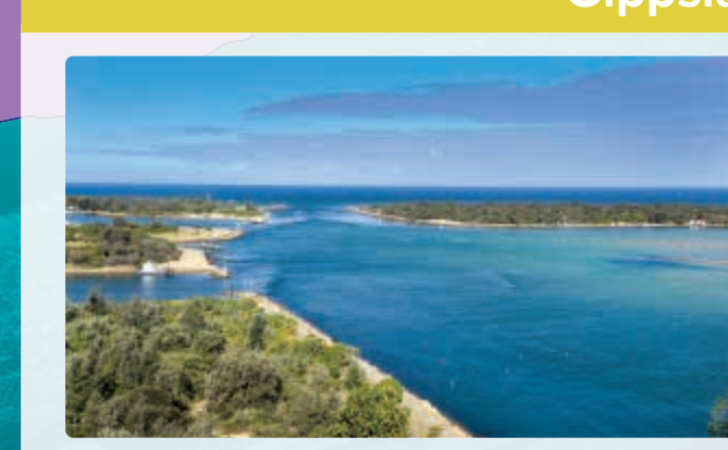
EGCMA, GLaWAC, Parks Victoria, TfN, DEECA, EGSC

To maintain, and where necessary improve, the ecological character of the Gippsland Lakes Ramsar Site and promote wise use.