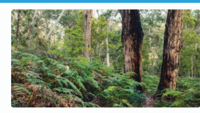
EGCMA, EGSC, TfN, GLaWAC, DEECA, AV